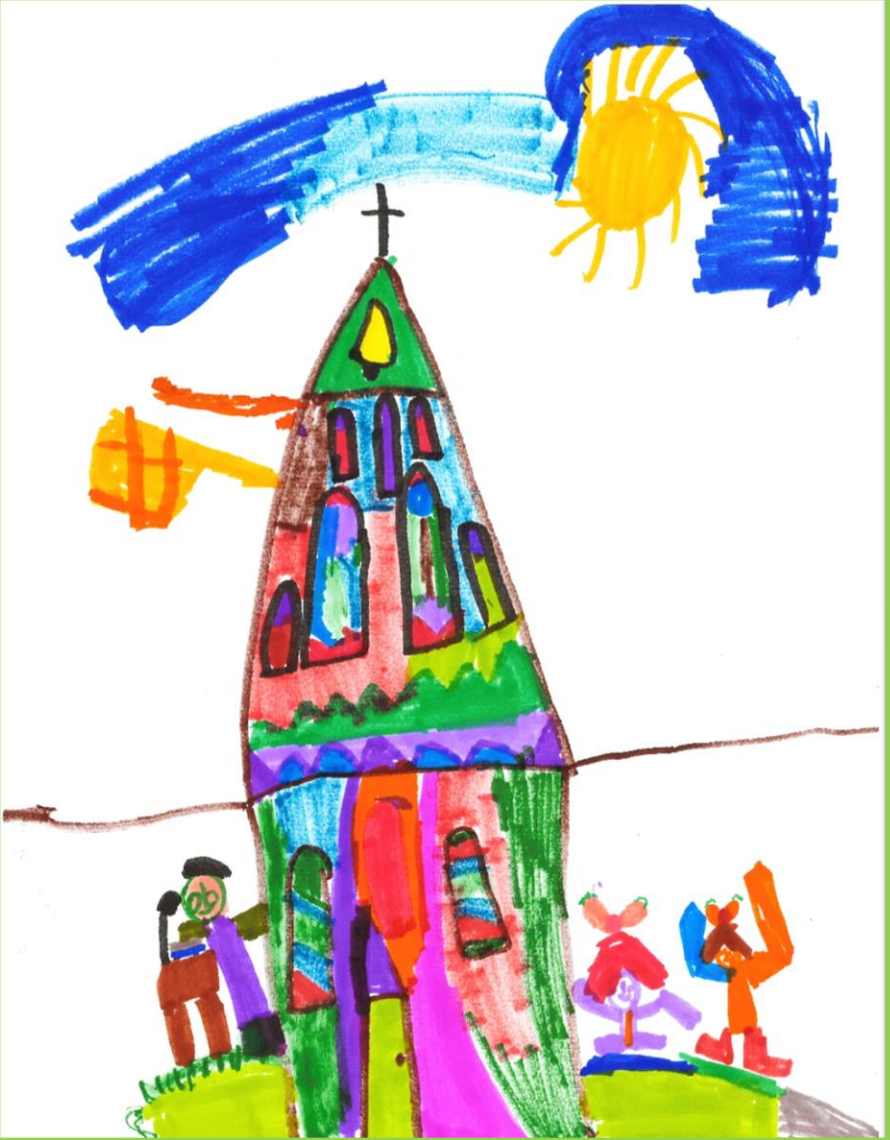
Emilia Dugan, 2020